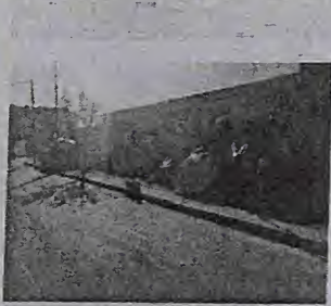
4640 Vermont Place.JPG 2266K